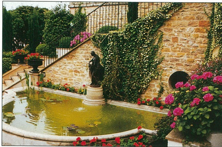
The garden at the Villa Florentine restaurant

Luncheon on July 4 was served at the Chalet du Parc in the Parc de la